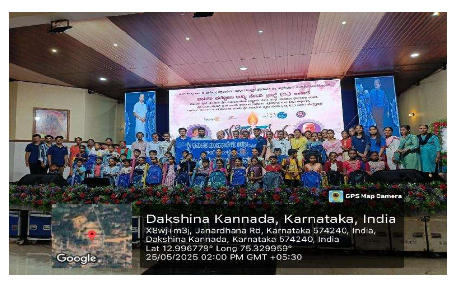
'Sharasetu Bandhana' Harikatha Performance

The NSS Unit, in collaboration with the Baduku Kattona Banni Team, Ujire, the Rotary Club, Belthangady, and other partner organisations, conducted a Felicitation programme "Yasho Vijaya" at Sri Krishnanugraha Hall, Ujire, on 25 May 2025. The event recognised top-performing SSLC students from Government Schools across Belthangady Taluk. As part of the initiative, school bags and umbrellas were distributed to 600 students from Classes 1 to 7.