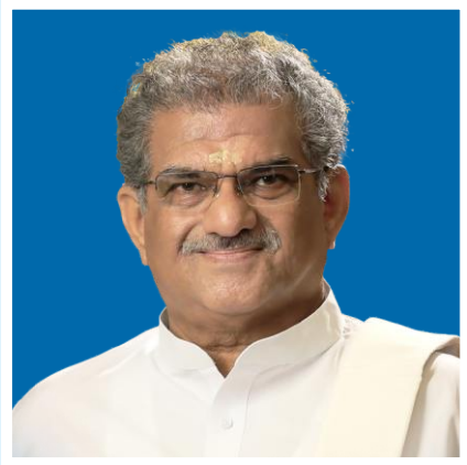
Dr. D. Veerendra Heggade Dharmadhikari, Sri Kshethra Dharmasthala & President, SDM Educational Society (R), Ujire.

Dr. D. Veerendra Heggade, Dharmadhikari of Shree Kshethra Dharmasthala, is a man of outstanding credentials. He is the head of Sri Kshethra Dharmasthala that draws millions of devotees from all over the country. However, his stature, doesn't confine to a single field of achievement. A titan in the field of social service and education Dr. Heggade with SDM institutions has been quite instrumental in uplifting the educational standards throughout Karnataka. As the President of SDM Educational Society, he has been phenomenally successful in leading more than 55 institutions.