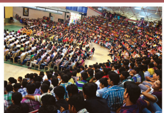
Indraprastha - Indoor Auditorium