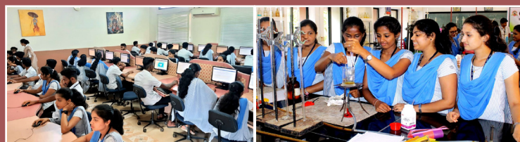
Computer Science Lab