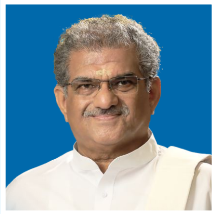
Dr. D. Veerendra Heggade Dharmadhikari, Sri Kshethra Dharmasthala & President, SDM Educational Society (R), Ujire.

Dr. D. Veerendra Heggade, Dharmadhikari of Shree Kshethra Dharmasthala, is a man of outstanding credentials. He is the head of Sri Kshethra Dharmasthala that draws millions of devotees from all over the country. However, his stature, doesn't confine to a single field of achievement. A titan in the field of social service and education Dr. Heggade with SDM institutions has been quite instrumental in uplifting the educational standards throughout Karnataka. As the President of SDM Educational Society, he has been phenomenally successful in leading more than 55 institutions.