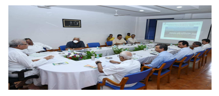
14th Governing Body Meeting of the College

A new lift has been introduced to the main building to facilitate the logistics in the college premises. This facility was also inaugurated on the occasion.